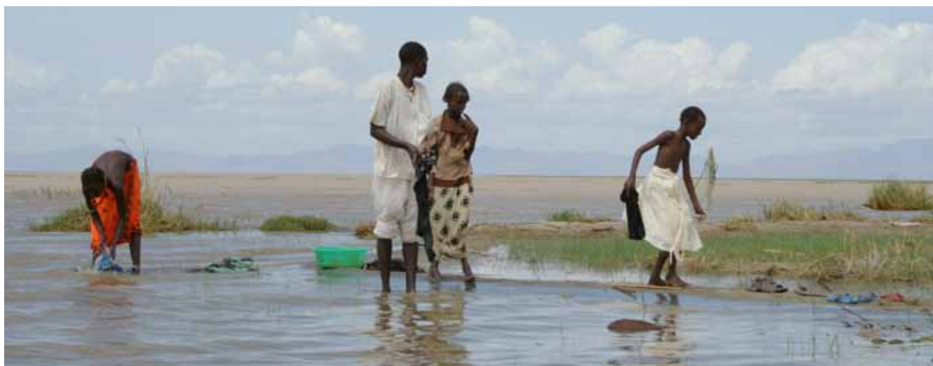
Kenya's Lake Turkana is at the heart of the lives of 300,000 people. If Gibe III is completed, the lake could shrink dramatically.

Ethiopia has huge potential for hydropower, and should be able to come up with much better projects than the disastrous Gibe dams. The country could benefit from adopting the guidelines of the World Commission on Dams, which among other things call for a thorough assessment of options for meeting energy needs before specific dam projects move forward. Ethiopia should strive to develop hydropower projects that impose the fewest impacts on its people and the environment, and ensure that future projects are well-designed, sufficiently studied, publicly debated, and follow domestic laws and regulations. Such steps would reduce the risk of development disasters like Gibe III in future.