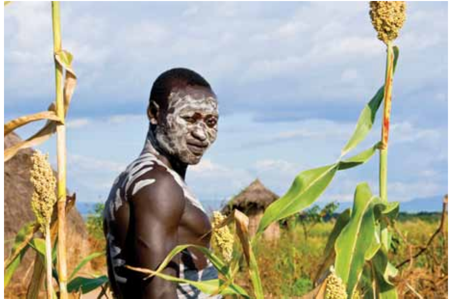
A farmer in his fields in the Lower Omo Valley. Some 500,000 pastoralists who call the area home could be harmed by changes to the river from the Gibe dam development.

For example, a 2010 report on the problems that beset Gibe II, written by independent Ethiopian engineers, raises alarms about the poor seismic studies for Gibe III. The engineers say that the Gibe III study minimizes actual risk to the project, calling it "erroneous but also reckless," and note that large earthquakes have occurred in the project area. "Neglecting the risks posed by seismic hazards in such a