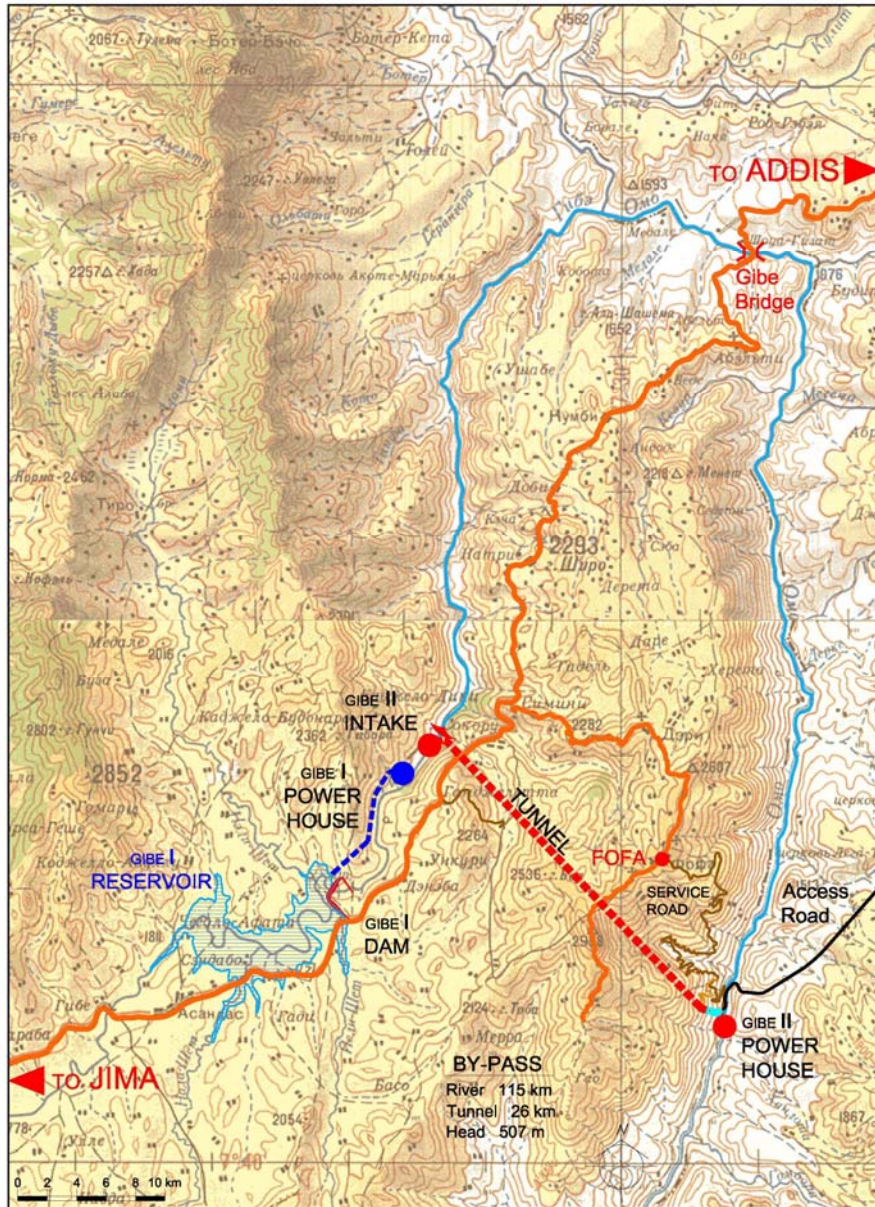
Fig.1. General layout of the hydroelectric system.

Basic features The general layout is reported in Fig. 1. The first plant of the Cascade regulates the Gilgel Gibe river with a reservoir of approximately 840 \text{ Mm}^3 .