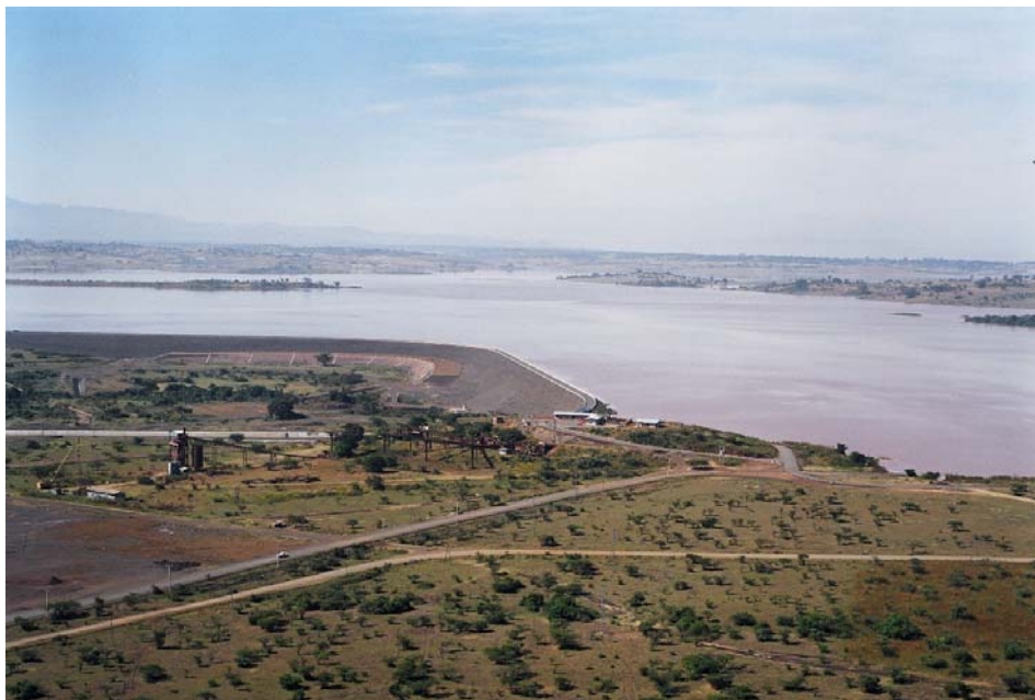
Fig.2. The Gibe I dam on the Gilgel Gibe river.