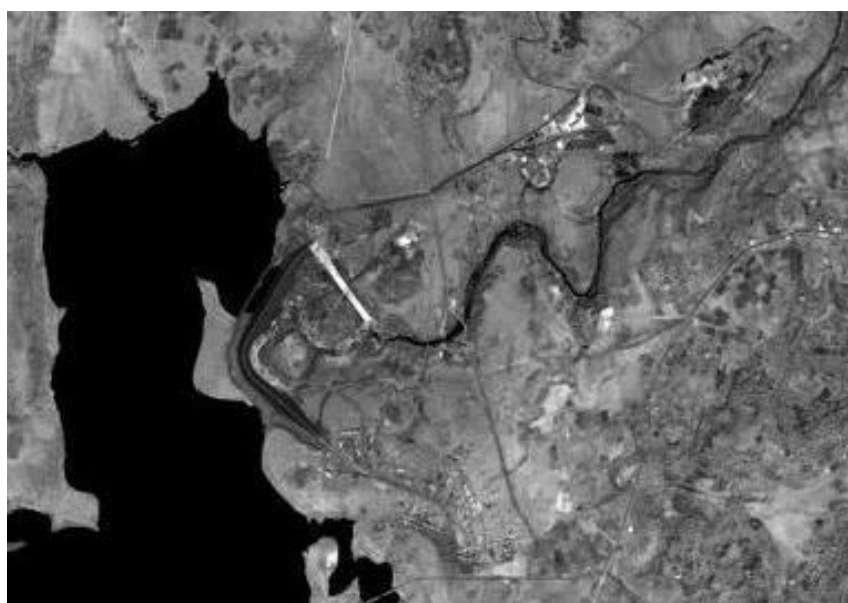
Fig.3. Satellite view of the Gibe I dam and reservoir. It is possible to see the spillway chute on the left bank.