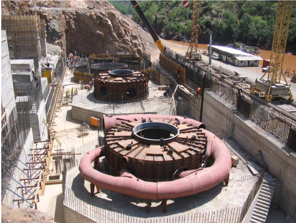
Fig.4. The Gibe II power house, under construction.

The selection of the general layout of the two cascade plants scheme has been governed by a number of technical and economic considerations, and was substantially influenced by the geological conditions of the area.