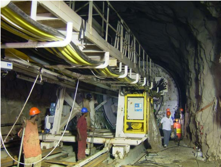
Fig.6. Gibe II tunnel - Launching chamber of the TBM

The excavation of the 26 km long tunnel with a diameter of 7 m for Gibe II is carried out mostly with two TBM (Tunnel Boring Machines) moving contemporary from the upstream and downstream side. An upstream and downstream trunk (~250 m long) were excavated with traditional drill and blast method. At the end of this sections the launching chambers (20 m long) were assembled (Fig. 6). Then the TBMs started the excavations from the launching chambers up to the dismantling chamber, located approximately in middle of the tunnel. The tunnel slope is 1.605 m/km. The elevation of the tunnel is about 1410 m a.s.l. and has an overburden between max. 500 m and 1200 m. A precast segmental lining system was chosen.